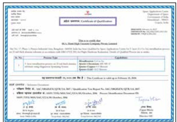
Space Qualification for HMC Metallization